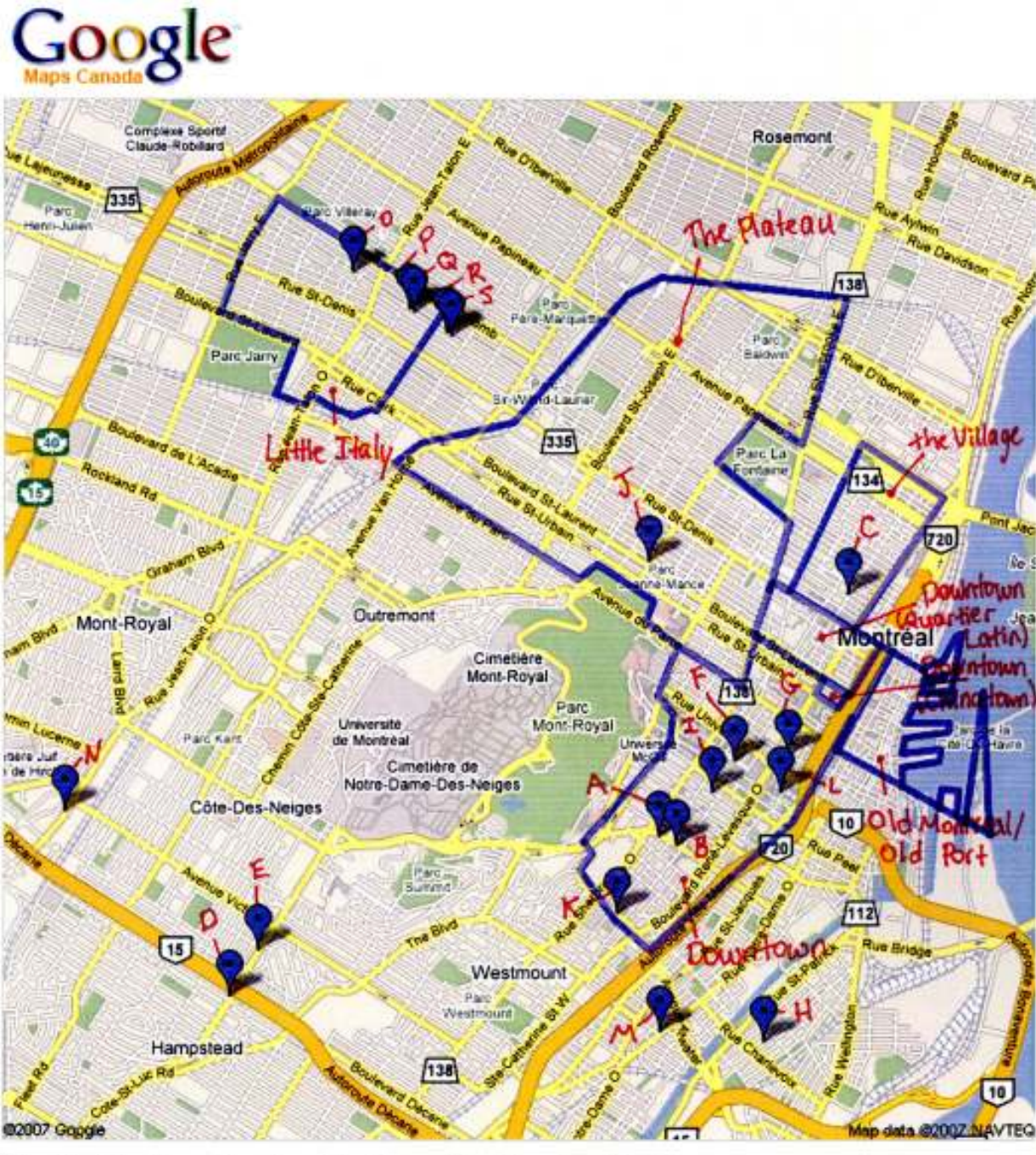
Figure 1: The dollar store sites (from the initial and secondary data collections) were labelled by their alphabetical site name (labelled A, B, C etc.). The complete list of sites is present in Appendix C. The tourist districts (Downtown, Little Italy, the Village etc.) are outlined in blue and labelled by the name of that area. Eleven sites were located within the tourist districts and seven sites were located outside of the tourist districts.